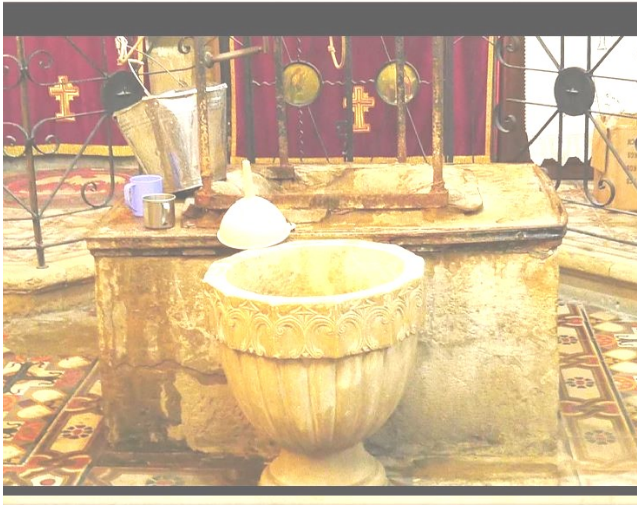
Shechem ~ Jacob's Well