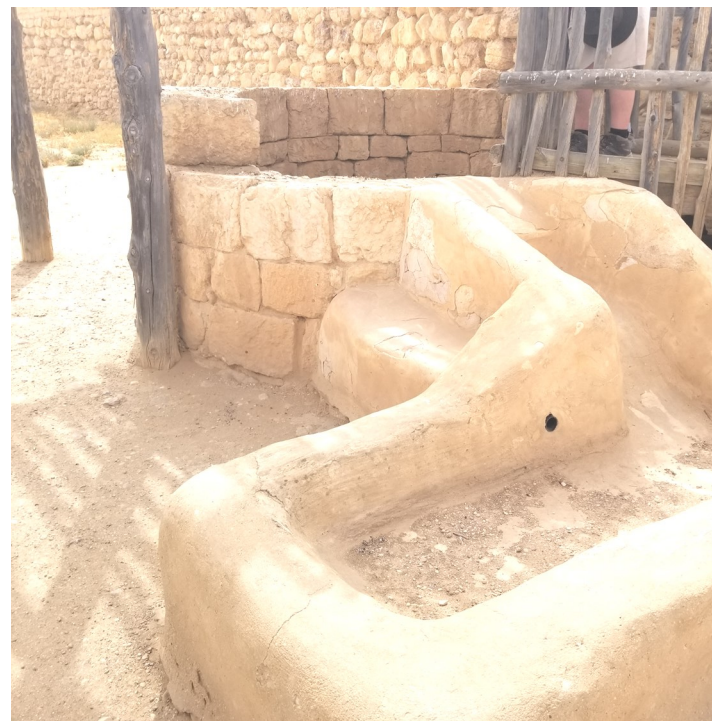
The Well of Beersheba Outside of the city