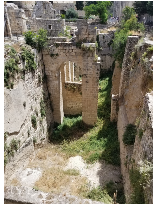
View from above the steps