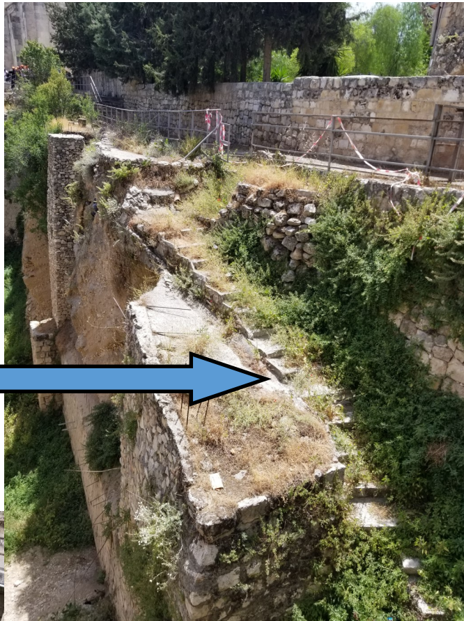
Steps down to the pool