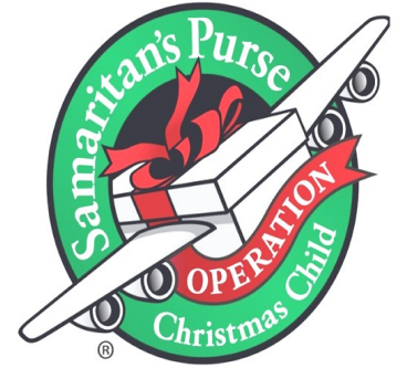
A few examples of the journeys our shoeboxes may go on.

Filled shoe boxes and $10 per box for shipping must be returned by November 24th.